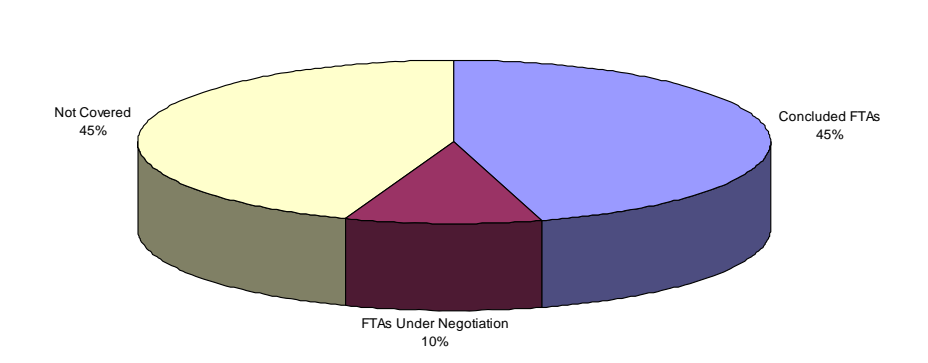
Figure 1: Coverage by PTAs of APEC Member Exports to Other APEC Economies (2002-4 Trade Data)

Figure 1 shows that PTAs already concluded cover 45% of intra-APEC export flows, and this figure would rise to 55% if all PTAs currently under negotiation are successfully concluded. On the other hand, 45% or almost half of intra-APEC export flows remain untouched by PTA initiatives. Figure 2 in turn makes clear that it is primarily the trade flows between the major "hub" economies and the flows involving Taiwan (Chinese Taipei) and Hong Kong that have remained outside the scope of the regional spread of PTAs. Trade flows between the US, China and Japan and all trade of Taiwan and Hong Kong except Hong Kong's trade with China and New Zealand have yet to be the subject of a serious PTA negotiation. Korea and Japan have held FTA negotiations but those negotiations are currently suspended. Prospects for establishment of free trade among the major Northeast Asian economies in the foreseeable future do not appear bright. It remains to be seen whether the recently announced commencement of FTA negotiations between the US and Korea will catalyse increased interest in PTAs between the major Northeast Asian and North American economies.