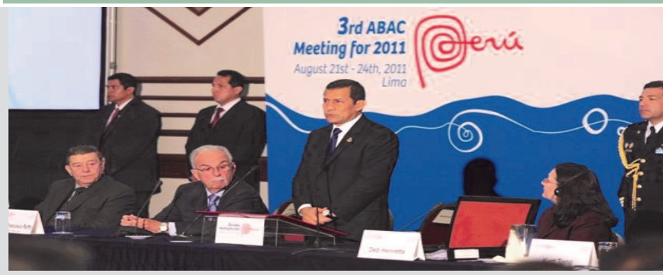
Peruvian President Ollanta Humala (standing, middle) welcomed the APEC Business Advisory Council (ABAC) and formally opened its 3rd Meeting for 2011 held on 22-24 August in Lima, Peru.