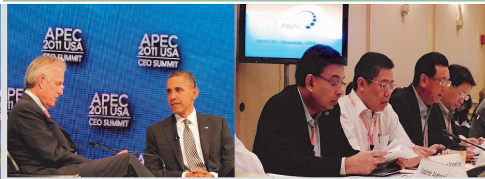
(left): APEC 2011 Host, U.S. President Barack Obama addressing issues in the region during the APEC CEO Summit 2011; (right): At the ABAC IV Concluding Meeting held the day before the CEO Summit.