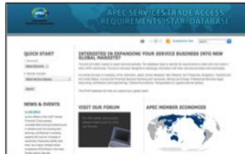
APEC Service Trade Requirement (STAR) Database aims to help SMEs take advantage of new export opportunities www.servicetradeforum.org

"Both of these databases have undergone pilot phases to test functionality and to develop content