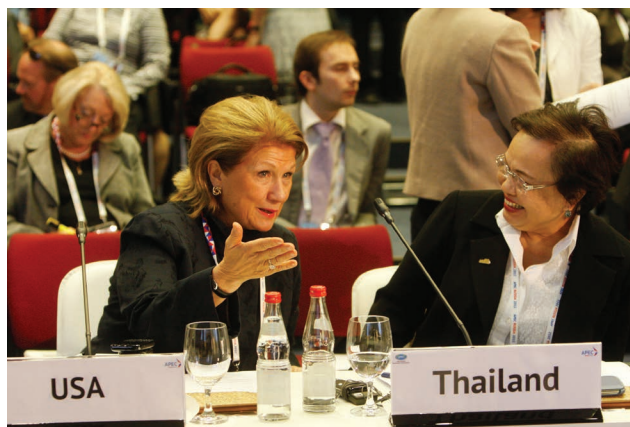
Delegates discuss policy between sessions at APEC’s second high level conference on Women and the Economy in St. Petersburg (June 2012).

Visible government support for the empowerment of women is a vital aspect of driving increased participation of women in all parts of the economy. This includes the creation of support programs designed to facilitate training and networking. In addition, it is vital that governments publically recognize substantial achievements by businesses in empowering women. These positive business results provide instructive examples that other businesses can utilize and highlight the competitive advantage of empowering women. Statements by officials and high profile figures demonstrate buy-in and commitment to the broader community, building a greater understanding of the practices that facilitate the empowerment of women and the benefits associated with their successful implementation.