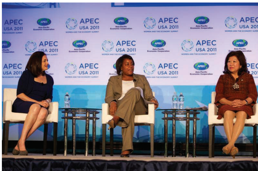
Facebook COO Sheryl Sandberg engages former Indonesian Minister of Trade Mari Pangestu in a discussion on the macroeconomic impact of engaging women in the economy at the first APEC Women and the Economy Summit in San Francisco (September 2011).

In some cases multinational companies have seen the advantages of expanding their supply chain reach or providing locally sourced goods for their local operations in developing market economies, particularly in retail and consumer goods. By reaching out to women-owned enterprises, new and potentially better suppliers can be found, enhancing the goods or services and competitiveness of the multinational or large local company and providing significant business benefits.