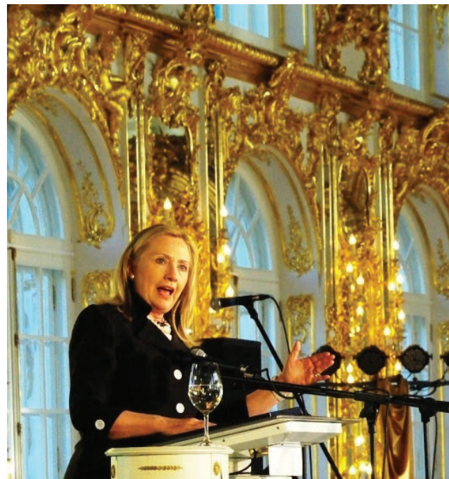
Then US Secretary of State, Hillary Clinton, addresses attendees of APEC's second high level conference on Women and the Economy in St. Petersburg's Catherine Palace (June 2012).

However, some promising trends are beginning to change the situation. Many women are getting experience on not-for-profit boards and NGOs, as well as State-Owned Enterprises, where governments can ensure greater inclusion of women in executive management and on boards. Networks for corporate directors that are present in some economies are providing training and education, networking opportunities and even mentoring to enhance the prospects for more women on boards.