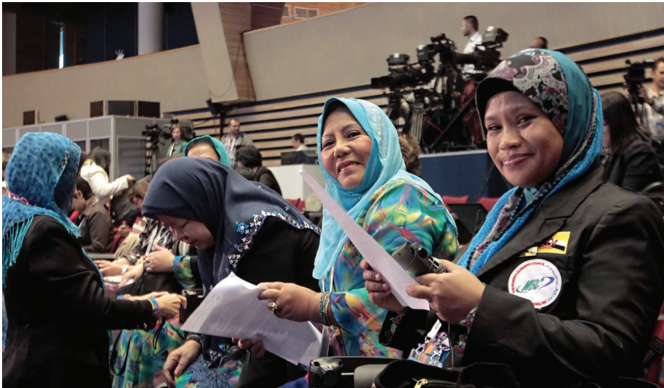
Delegates participating in APEC's second high level conference on Women and the Economy in St. Petersburg, Russia (June 2012).