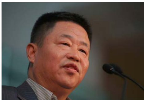
ABAC 2014 Chair, Ning Gaoning, welcomes delegates of ABAC 1 meeting in Auckland, New Zealand