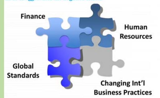
The inter-locking nature of key barriers to SMEs participation in GPCs aggravates the negative effects

porations in terms of providing intermediate goods and services to the production of goods but highlights the limitations SMEs continue to face for their own growth. “Before entry into global production chains (GPC), SMEs need a sound financial base to make upfront investment so that they could establish productive