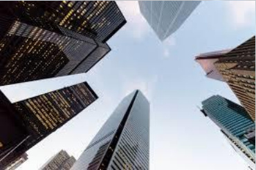
Over 150 organizations