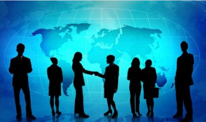
Over 300 individual experts